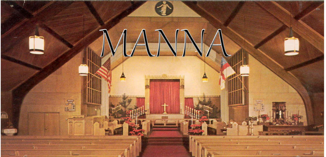
Christ Episcopal Church