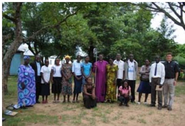
Our sponsored graduates before their trip to Uganda